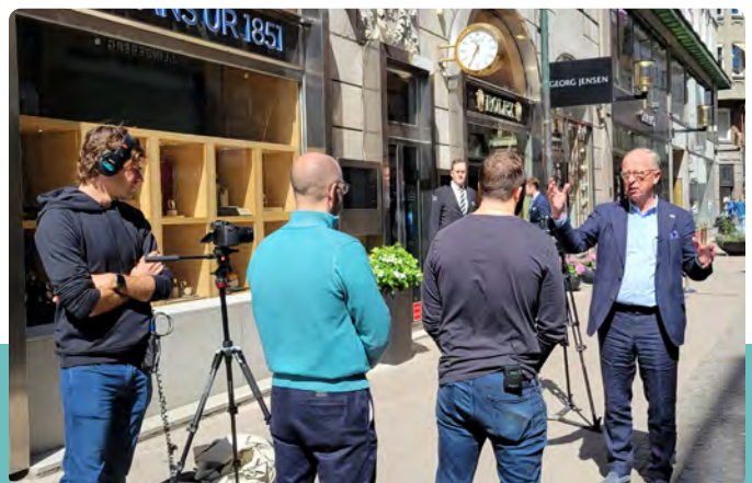
SecondStreet.org prepared to interview a retired politician in Sweden about their health care system.

In the coming months, we will be releasing more patient stories, putting out more research and launching PatientOptions.ca. The new site will provide patients with insight about how to navigate long wait times in Canada’s public system, and it will include helpful information about pursuing private options within Canada and abroad.