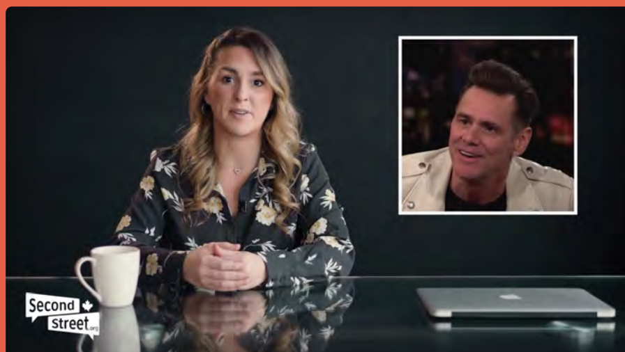
SecondStreet.org fact checks actor Jim Carrey's comments on Canada's health care system.

Or donate online at: www.secondstreet.org/donate