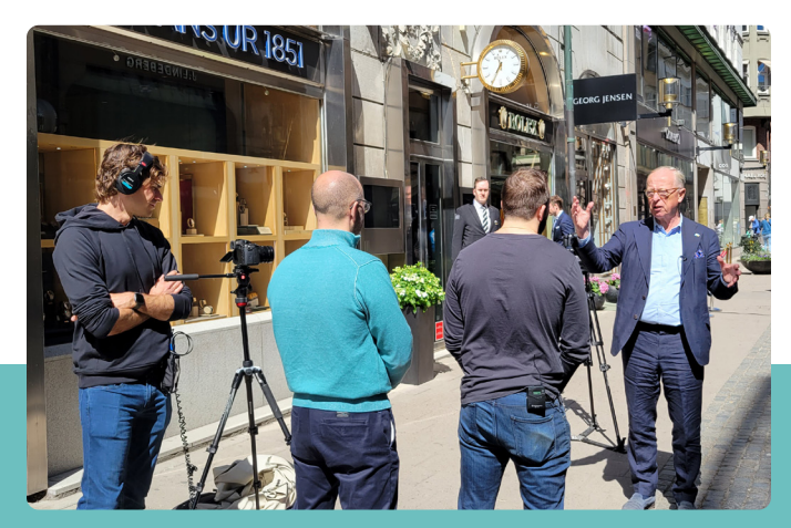
SecondStreet.org prepared to interview a retired politician in Sweden about their health care system.