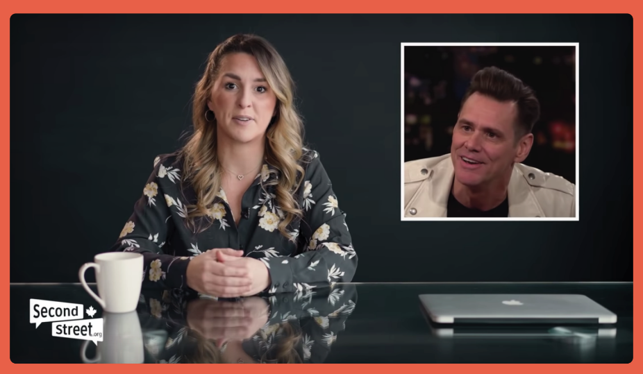
SecondStreet.org fact checks actor Jim Carrey's comments on Canada's health care system.