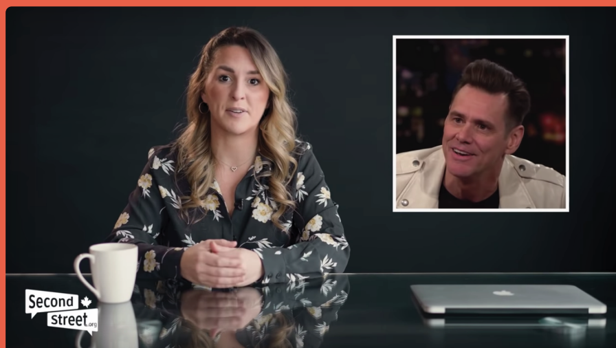
SecondStreet.org fact checks actor Jim Carrey's comments on Canada's health care system.

Or donate online at: www.secondstreet.org/donate