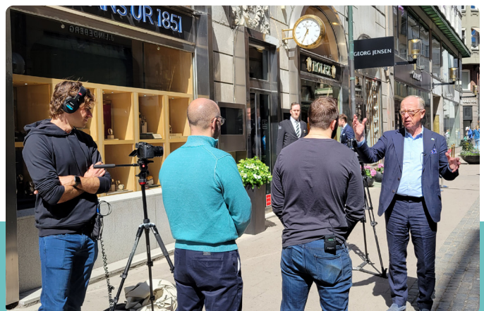
SecondStreet.org prepared to interview a retired politician in Sweden about their health care system.

In the coming months, we will be releasing more patient stories, putting out more research and launching PatientOptions.ca. The new site will provide patients with insight about how to navigate long wait times in Canada’s public system, and it will include helpful information about pursuing private options within Canada and abroad.